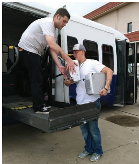
The multi-media team arrives...

I'm sure you're wondering: 'How are your investments distributed'? We often find ourselves determined to reach out (Service Above Self) and help someone who is desperate for help. When we fail to see improvement right away, our resolve can weaken. The Apostle Paul urges us to be patient in helping one another through the stumbles and struggles of life. Paul writes 'Carry each other's burdens and so fulfill the law of Christ' (6:2) - a comparison to the task