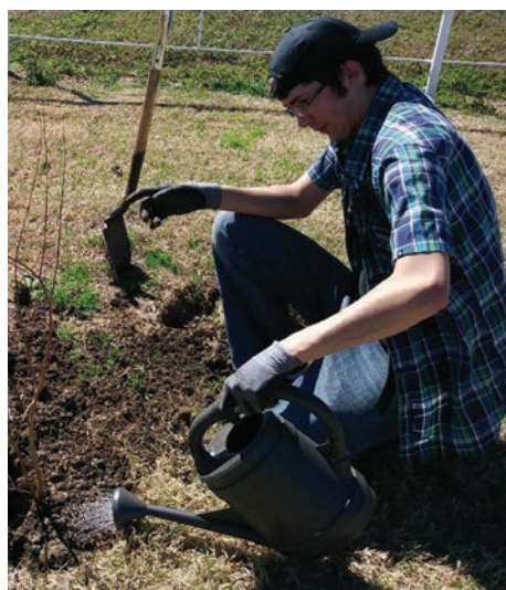
One plants, one waters...

Seats Are Limited! All Tickets Must Be Purchased In Advance! No Tickets Sold At The Door! All Dinner Lines Open at 6:30 P.M.