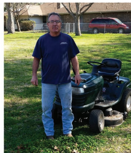
...or the easy way.