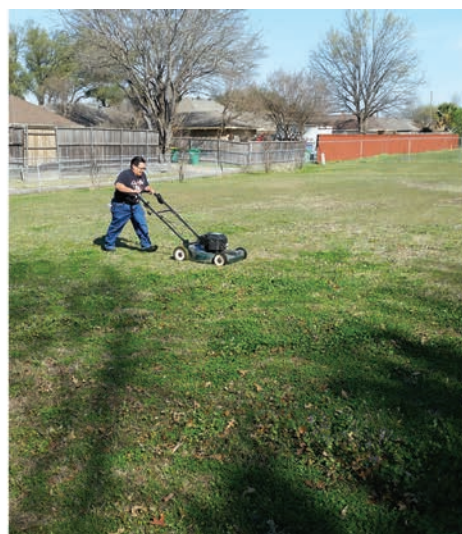
We can do this the hard way...