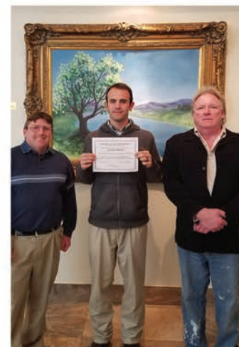
Another Personal Studies Unit Completed