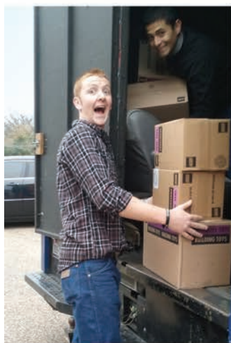
Doing all things as unto the Lord...