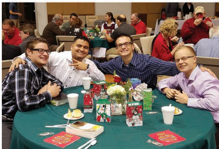
Brisket & cheesecake - a traditional Christmas meal for TLC at D1AG