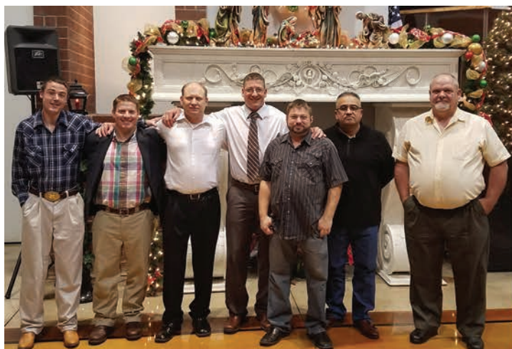
TLC at D1AG. Sitting while someone sings to them for a change...