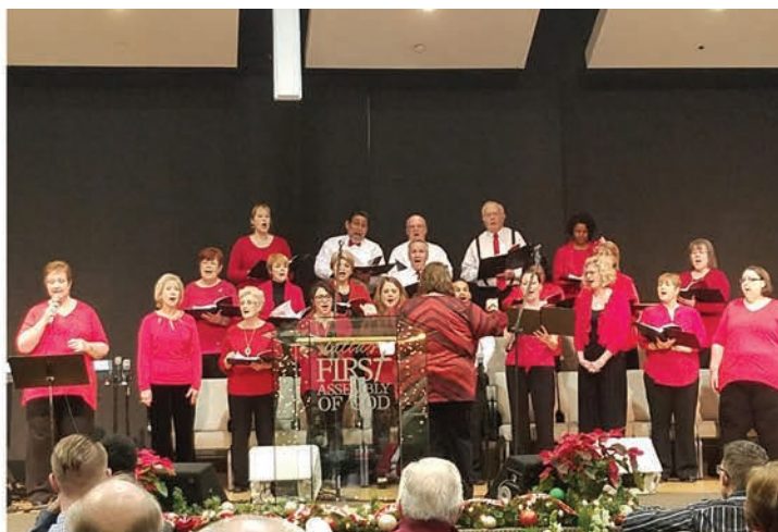
Dallas First Assembly of God's Christmas Cantata.