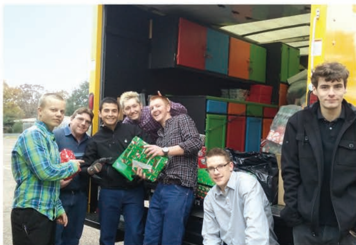
Unpacking presents for Metro Ministries Christmas Store