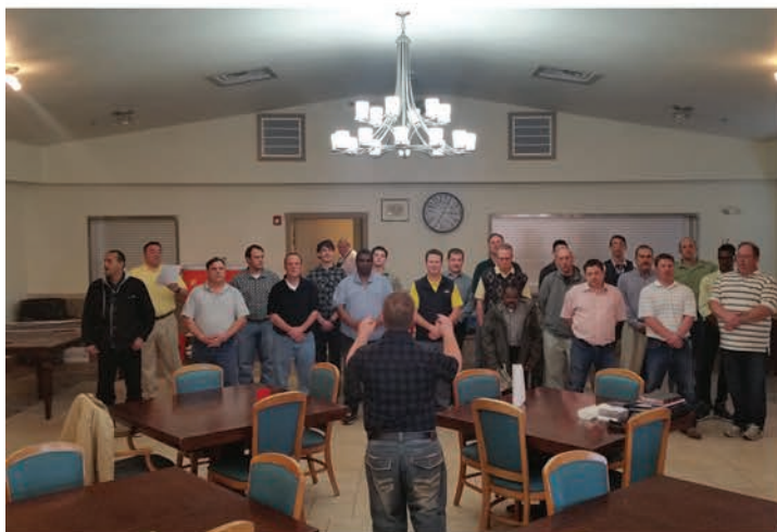
The standard view of a choir...