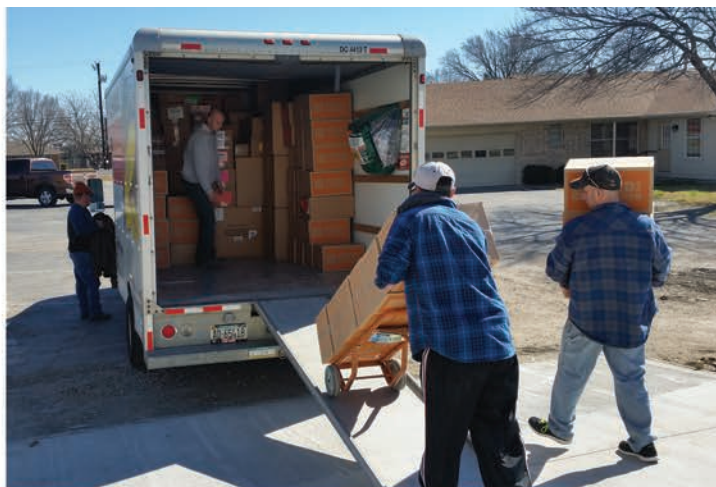
Not just men love to eat. TLC team's up with local charities to feed children in DFW.