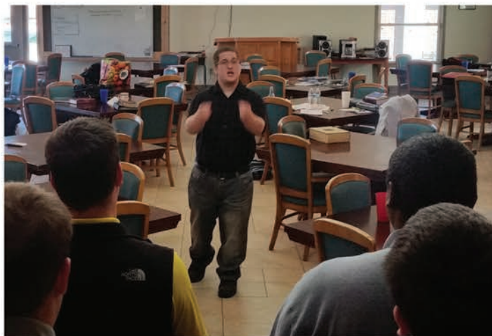
Ever wonder what it looks like from the other side of the choir?