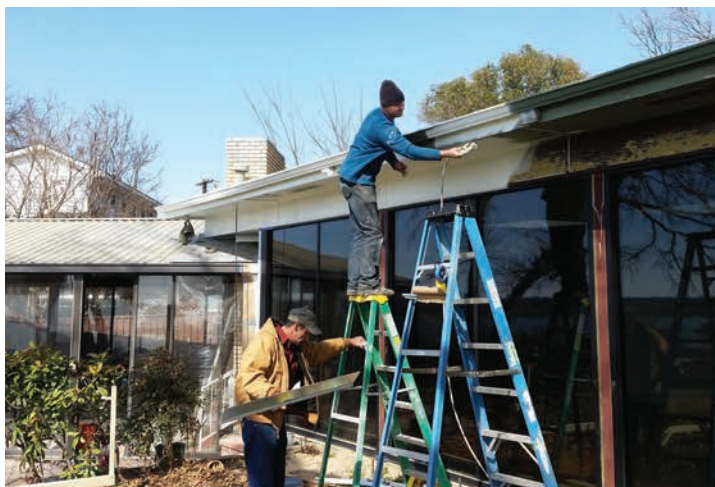
Working their way to the top of the ladder.