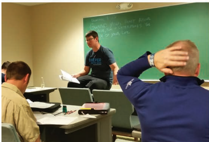
In the classroom - student teachers provide a literal head scratcher.