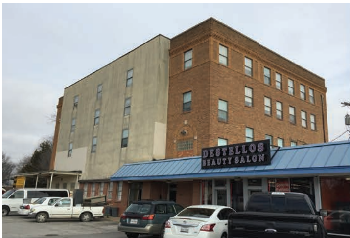
Goodbye 1106 Graham Ave... 34 years and 3,400 donuts later... give or take a dozen.