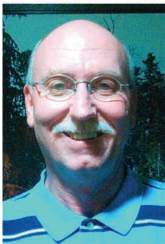
The real Tom Petty.