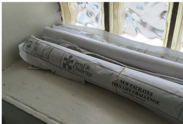
Plans Changes. Plans for the new home in Desoto sit on a window sill of the old home...