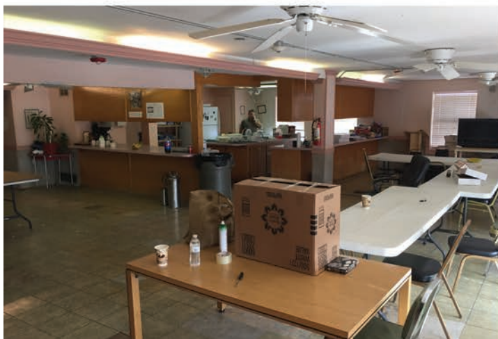
Packing up everything but the kitchen sink.