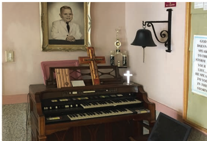
The (cafeteria) corner chapel. Where 2 or 3 are gathered... that's church.